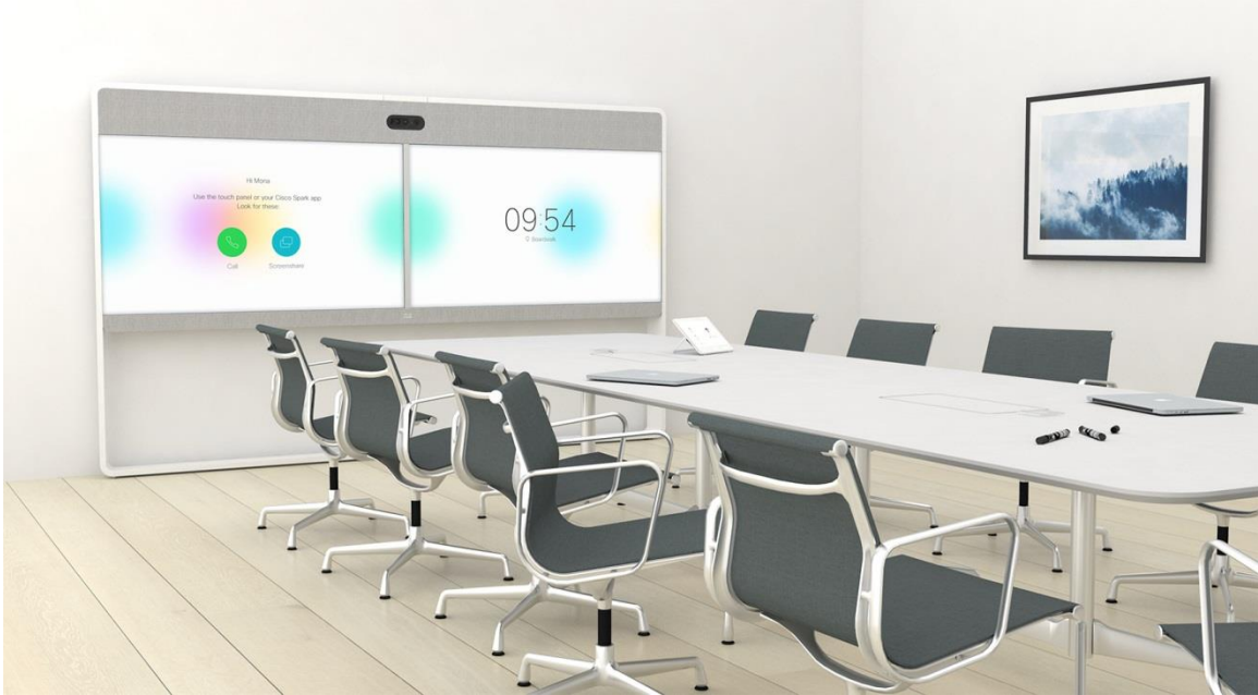
Figure 2. Cisco Webex Room 70 G2 in a large conference room