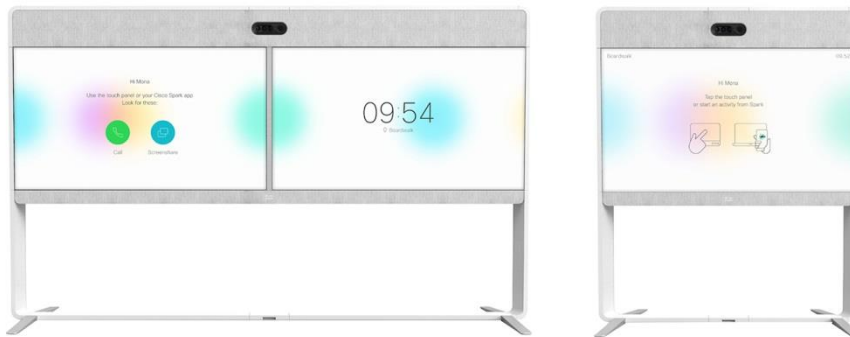
Figure 1. Cisco Webex Room 70 Dual G2 and Room 70 Single G2 on a free-standing floor stand

Cisco Webex ® Room 70 G2 delivers the industry-leading video and audio experience customers have come to expect from Cisco. In addition, new capabilities enable even smarter meetings, smarter presentation capabilities, and smarter room and device integrations – further removing the barriers to usage and deployment of video in large-sized rooms. The Room 70 G2 is built on the powerful Cisco ® Webex Room Kit Pro technology platform. This means there are more inputs and outputs to cover more meeting scenarios and larger rooms by adding another screen for content or installing a Cisco TelePresence ® Precision 60 Camera in the back to give presenters flexibility to move around. The Room 70 G2 now offers more power and flexibility to build custom and more specialized video conference rooms than ever before.